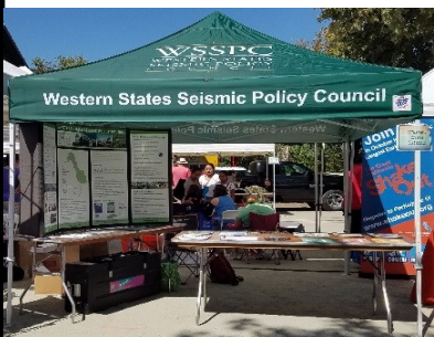
WSSPC tent at the Cal OES Preparedness Day Event.

On Saturday, August 26 th California Governor's Office of Emergency Management (Cal OES) and the Pacific Gas and Electric Company (PG&E) hosted the 12 th Annual Day of Preparedness in Old Sacramento. The event was the kick off for September's National Preparedness Month. Over 40 state and local agencies, public safety departments and non-profit organizations showcased interactive and educational information throughout the day.